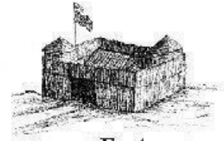
Fort Walla Walla Cellars

"preserving and sharing Walla Walla regional history" from the sale of a limited edition Merlot wine