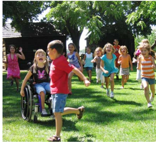
R-Kidz Early Childhood Education Center enjoys an admission-free school tour

The Museum is pleased to offer its new Entry Hall & Exhibit Galleries with three special exhibits scheduled for 2011.